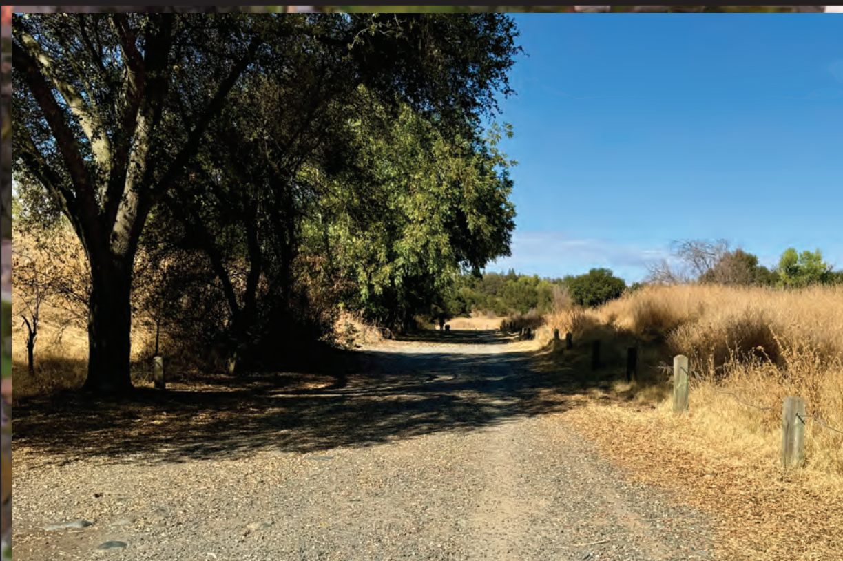
Sailor Bar Gravel Roads Over Two Miles Long