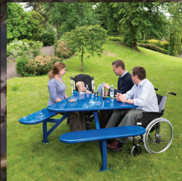
Wheelchair Accessible Picnic Table